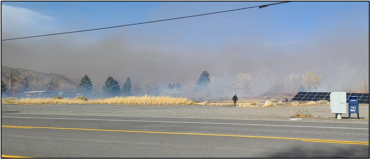
Figure 3: 12:01 p.m. Photograph of Specific Origin Area After Ignition

The fire agency investigation was complicated by environmental conditions, which impacted the evidence available to fire agency investigators and, as a result, limited their ability to draw reliable conclusions regarding the fire’s origin and cause. High winds and rain in the area of origin following ignition of the fire limited the quantity and availability of fire movement indicators that fire agency investigators could analyze (though the rainfall aided fire suppression efforts, as described in Liberty-04: External Factors ). 7 This rainfall occurred before fire agency investigators arrived on scene the day following the ignition, and may have limited their ability to draw reliable conclusions from the remaining markers. In standard wildland fire investigations, investigators meticulously identify, document, and analyze a large number of fire movement indicators in and around the suspected general area of origin to understand the fire’s movement and progression, as well as to identify the specific area where it originated. In contrast, the number of fire movement indicators that fire agency investigators documented and analyzed for the Mountain View Fire was quite small, which limited their ability to draw reliable conclusions regarding the fire’s specific origin area. It is also notable that one of the investigators assisting the fire agency investigation identified ignition points that appear to be outside the specific origin area identified by the fire agency report.