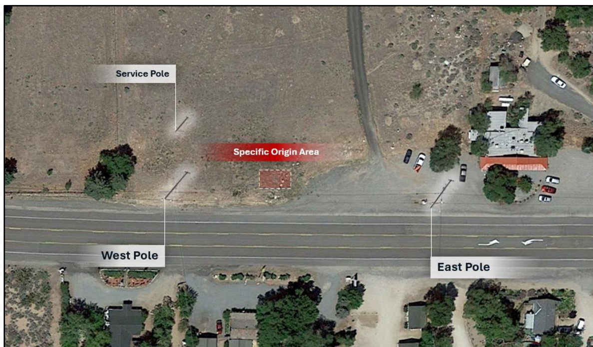
Figure 2: Specific Origin Area Identified by Fire Agency Report, with the West and East Poles Marked

lying on the ground adjacent to bleached rocks. 5 The fire agency report indicates that investigators mistakenly identified and focused on stains they thought were burn marks on rocks near this area and indications of ignition, and failed to search for and consider further evidence. Smoke patterns on these rocks, however, would have been indistinguishable between any arc flash and consumption of nearby fuel by the fire, and were adjacent to vegetation that was consumed by the fire some time after its ignition. Based on this, the fire agency report identified a specific origin area—a six feet by twelve feet rectangular area near the end of the conductor and the burned rocks. This area is located between the West and East Poles, just west of a parking turnout, as shown in Figure 2. 6 This location, however, appears unburned by an approaching flanking fire in photographic and video evidence captured by eyewitnesses shortly after the fire began (Figure 3), further indicating that fire agency investigators did not correctly identify the specific origin area of the fire.